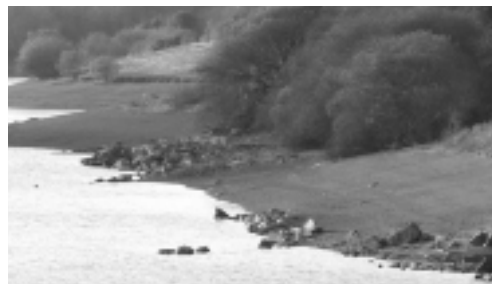
Low water levels at Argal, revealing the remains of Cornish hedges

In fact, it turns out that, despite the wet summer and autumn, reservoir levels right across the South West Water region are at low levels, following an exceptionally dry spring. South West Water say that they are not worried by the situation as the reservoirs normally fill during the winter when there is more rain and fewer visitors. They can also decide to draw water from one reservoir rather than another, so having different water levels in neighbouring reservoirs is not unusual.